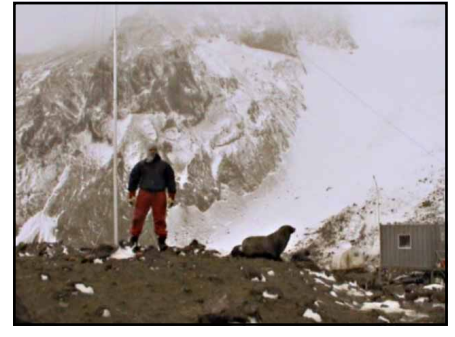
Chuck has a devil of a time keeping this vertical antenna vertical in the 90-MPH winds. Note the clothing he is wearing as well as the operating shack to the right.