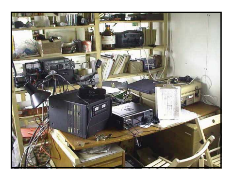
This is the 3Y0C operating shack. Chuck logs all QSOs the old fashion way—with pen and paper. He and the scientists sleep outside in tents.

Bouvet can be severe. He also thought the generator would be usable for 12 hours a day, but after recalculating the fuel consumption rate, he was forced to trim that down to 3-4 hours daily. Suggested SSB frequencies are: 1835, 3795, 7095, 14195, 14260, 18145, 21295, 24945, 28495 and 50120 kHz.